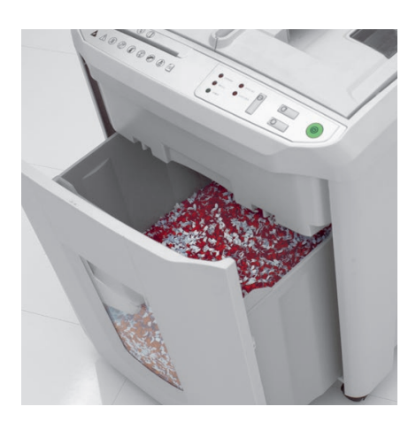
PRACTICAL SHRED BIN With window showing fill level and automatic stop if the shred bin is full or removed from the shredder housing.

Separate feed opening for shredding CDs/DVDs or plastic cards with a special cutting head. A separate bin allows easy waste separation.